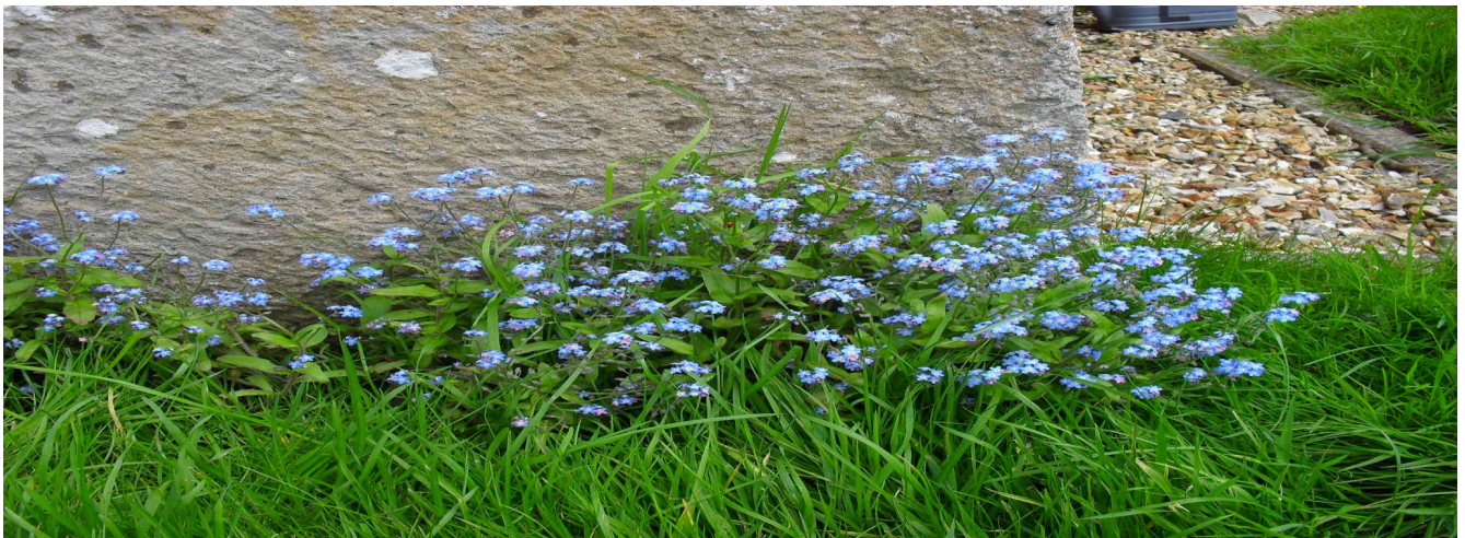
Images of Spring flowers