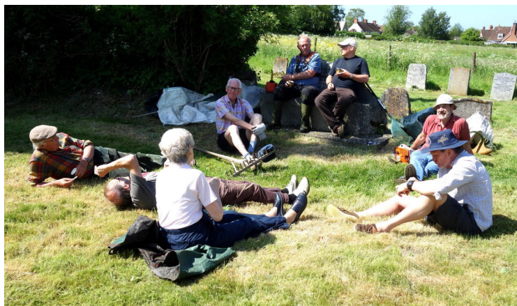
A 'work party' raking the grass in St Andrew's Churchyard on 27 May – well, having an ice-cream break when the picture was taken.