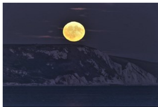
Hunters Moon over the Dorset coast 2018

The October Full Moon is known as the Full Hunters Moon, otherwise known as the Travel Moon or the Blood Moon.