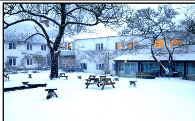
Springhead In Winter